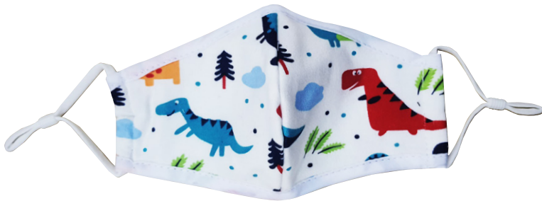
Fabric / Paediatric