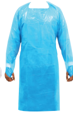
IC2008-50M / IC2008-140 Disposable Plastic Apron