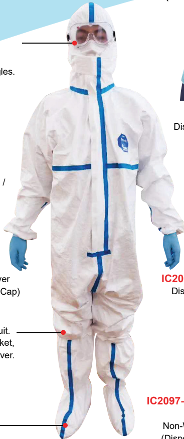
IC2104 Protective Coverall Suit. *including Hooded Jacket, Trousers and Shoe Cover. *Sterile.