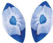
Disposable Shoe Cover