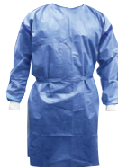
IC2097-NWBS / IC2097-NWB / IC2097-NWG Non-Woven Isolation Gown (Disposable Isolation Gown)