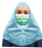
IC2094-000B Disposable Hood Cover (Tudung Cover)